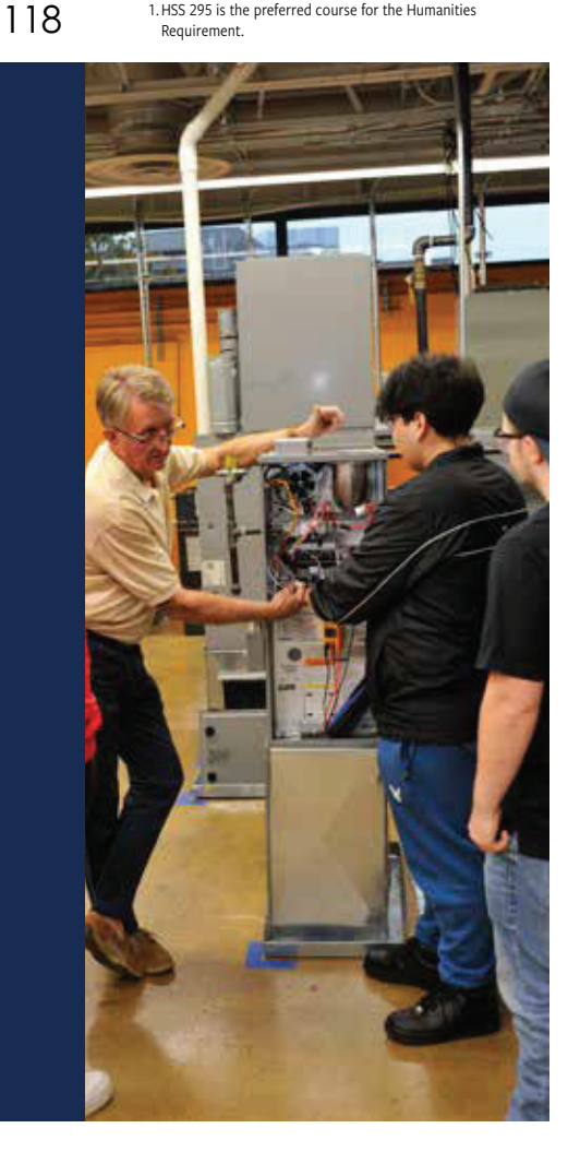
1. HSS 295 is the preferred course for the Humanities

course requirements can be completed on any TCTC campus or online, as available.